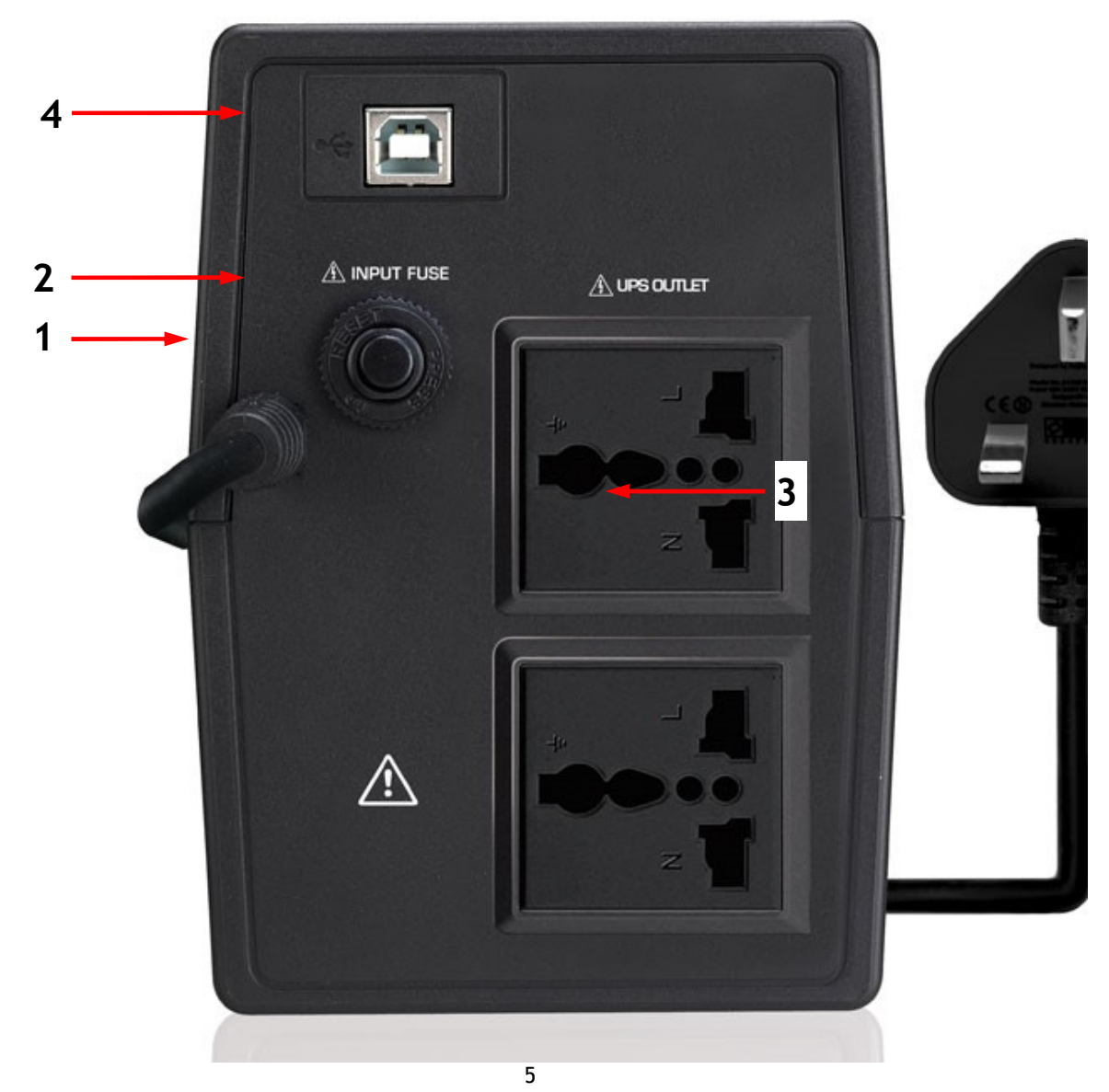
Figure 2 - Rear Side