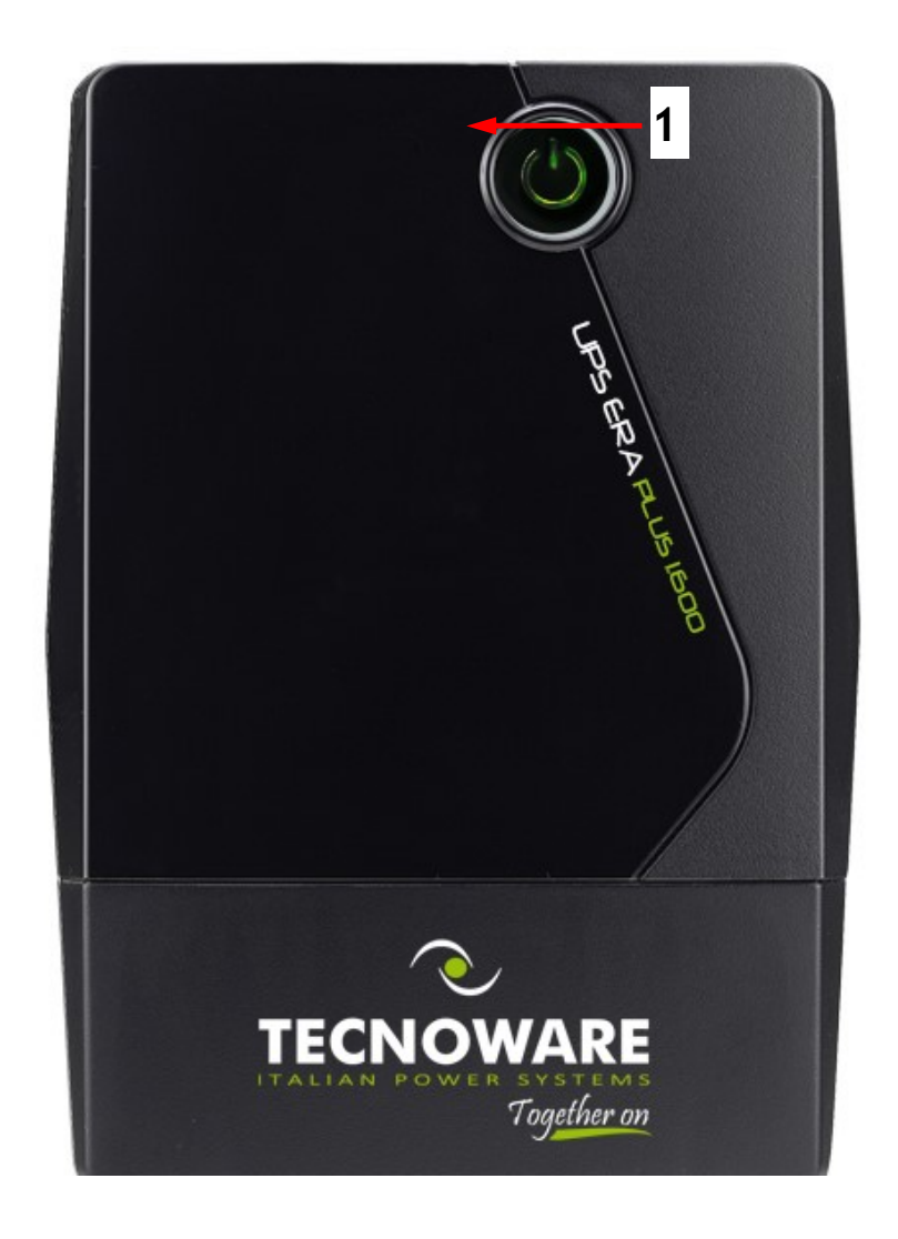
Figure 1 - Front panel

1. The ON/OFF button with LINE/BATTERY led enables the user to turn ON/OFF UPS and indicates with the led (green color) always active the functioning in Normal Mode, it flashes one time every 4 seconds in Battery mode and it flashes one time every second in Low Battery condition.